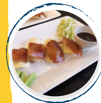
Peking D.I.Y. 片皮鴨