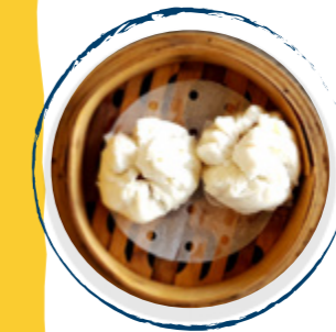
Steamed BBQ Pork Buns 叉燒包