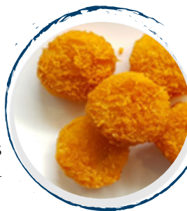
Deep Fried Scallops 炸帶子