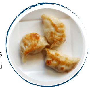
Pan Fried Pork Dumplings 香煎鍋貼