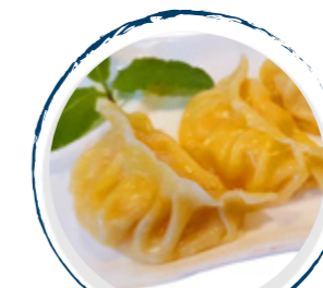
Ginger Prawn Dumpling 姜蝦餃